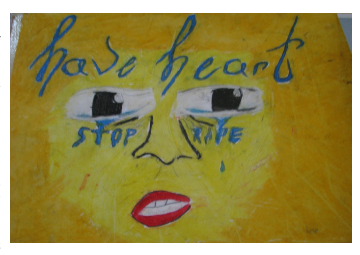
One of the paintings at the exhibition

Visual artists were to use any medium: paint, drawing, caricature/cartoon, digital/graphic art, photography, mixed media, crafts and sculpture such as stone, glass, wood, metal or other mixed materials. An assembly of jurors